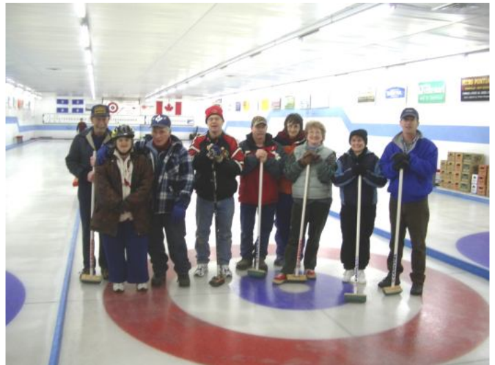
2006-7 Happy Rockers

- A Tutor Training Workshop will be held in Maniwaki on Sept. 28-29 in cooperation with the Maniwaki Adult Education and Vocational Training Centre of the Western Quebec School Board. We are pleased to be able to offer services in this part of our territory.