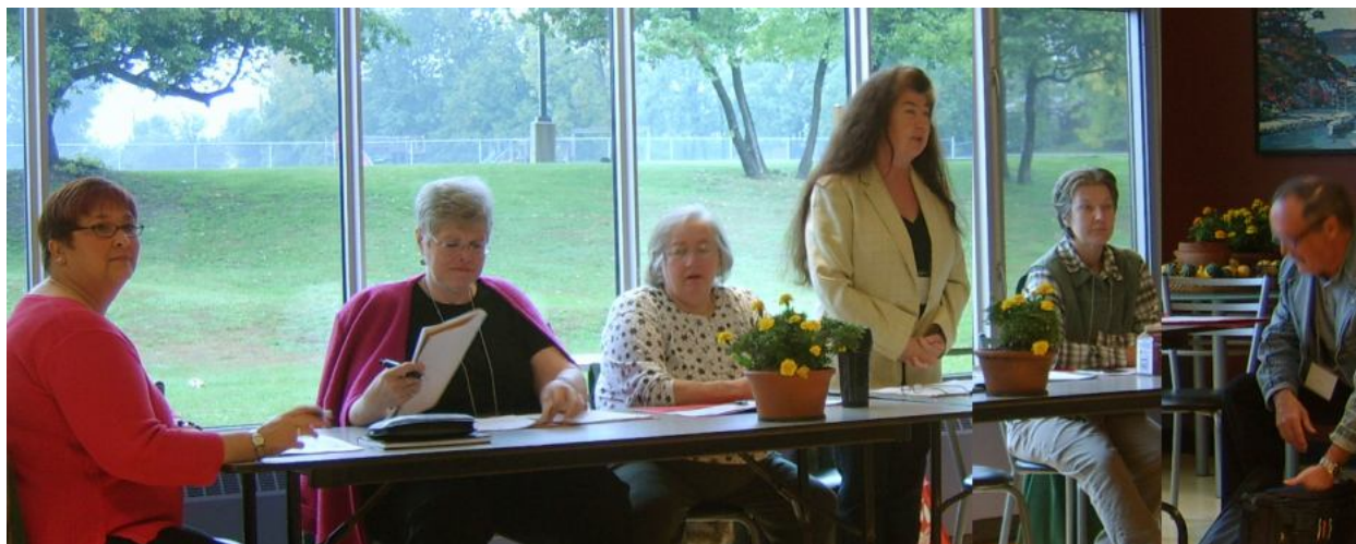
ANNUAL GENERAL MEETING CONFERENCE 2006

- Our 22nd Annual General Meeting was held on September 23, 2006 at the Western Quebec Career Centre in Gatineau. Twenty two members attended.